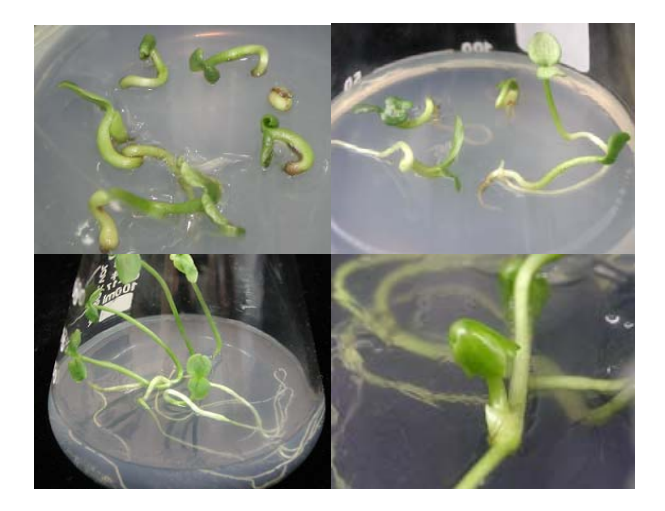
Figure 3 . Effect of hydroquinone on vitro culture of seed embryo of P.hexandrum. M1: Seedling cultured with 1.0 mg/L IAA after 30 days; M2: Seedling cultured with 1.0 mg/L GA<sub>3</sub> after 30 days; M3: Seedling cultured with 1.0 mg/L Hydroquinone after 30 days; M3: Seedling developed from bulb cultured on M3 after 40 days.