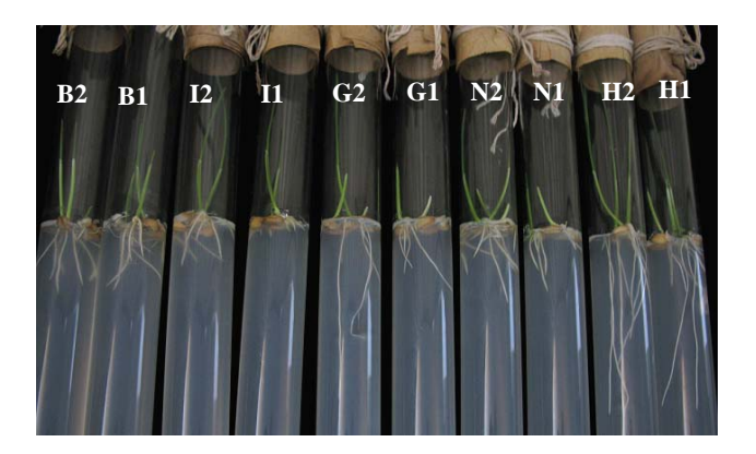
Figure 2 . Compare bioactivities between hydroquinone and other hormones on wheat (6th days). BAP, B2=1.0 mg/L; B1=1×10<sup>-1</sup> mg/L. IAA, I2=1.0 mg/L; I1=1×10<sup>-1</sup> mg/L. GA<sub>3</sub>, G2=1.0 mg/L; G1=1×10<sup>-1</sup> mg/L. NAA, N2=1.0 mg/L; N1=1×10<sup>-1</sup> mg/L. Hydroquinone, H2=1.0 mg/ L; H1=1×10<sup>-1</sup> mg/ L.

(Figure 3) showed that after culturing 30 days, the embryo growth (Figure 3, M3) of P.hexandrum seed was significantly hastened compared to IAA (Figure 3, M1) and GA_3 (Figure 3, M2), and the seedling (M3) was strong and healthy with the root developed. In addition; after culturing 40 days, the bulb of seedling (Figure 3, M3-1) began to rosette euphylls that needs 1 year to grow and develop at natural Condition that showed the growth and development of P.hexandrum was hastened and the cycle of the growth and development shortened by adding hydroguinone at a degree concentration.