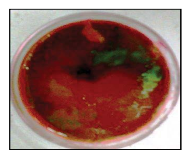
Figure 1. Contaminated from E. coli.

The bacterial waste products generated, organic acid metabolites change the pH indicator in MSA from red to bright yellow (Table 3 and Figures 3A and 3B).