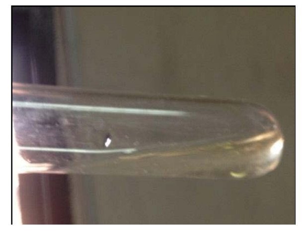
Figure 3B. Plasma has been coagulated at the bottom part confirming the presence of Staphylococcus aureus .