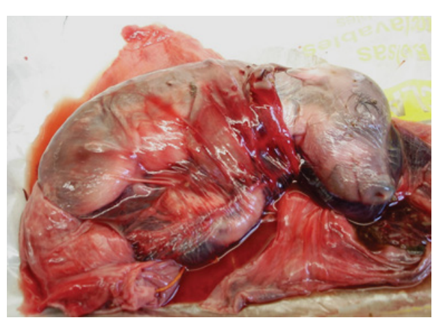
Figure 1: Wild boar fetus and placenta.

Direct immunofluorescence staining of liver, spleen, lung and kidney samples were performed with a