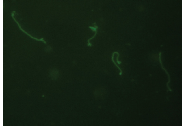
Figure 2: Direct immunofluorescence staining of a kidney sample from wild boar fetus ( Sus scrofa ).

multivalent FA, LEP-FAC (Seasinglab, Argentina) conjugate specific for Leptospira spp. (Figure 2)