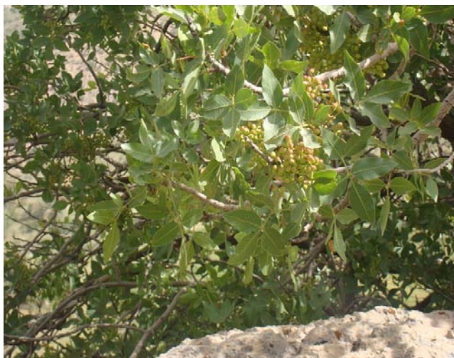
Figure 1. Pistacia khinjuk from Bakhtiari Mountains, Central Zagross, Iran

chromatograph (Young Lin, Dongan-gu, Anyang-si, Kyounggi-do, Korea) with HP-5MS 5% phenylmethylsiloxane capillary column (30 m x 0.25 mm, 0.25 \mu m film thickness) equipped with an FID detector. Oven temperature was kept at 50 °C for 5 min initially, and then raised at the rate of 3 °C/min to 240 °C. Injector and detector temperatures were set at 290 and 300 °C, respectively. Helium was used as carrier gas at a flow rate of 0.8 ml/min, and diluted samples (1/1000 in n-pentane, v/v) of 1.0 \mu l were injected manually in the splitless mode. Peak area percents were used for obtaining quantitative data.