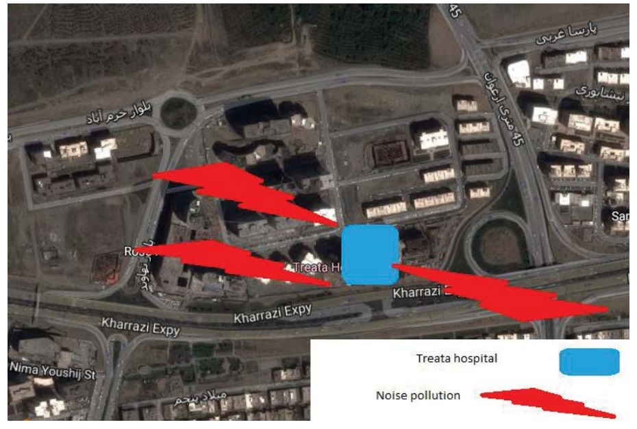
Figure 4. Treata hospital noise pollution (Author harvest field).