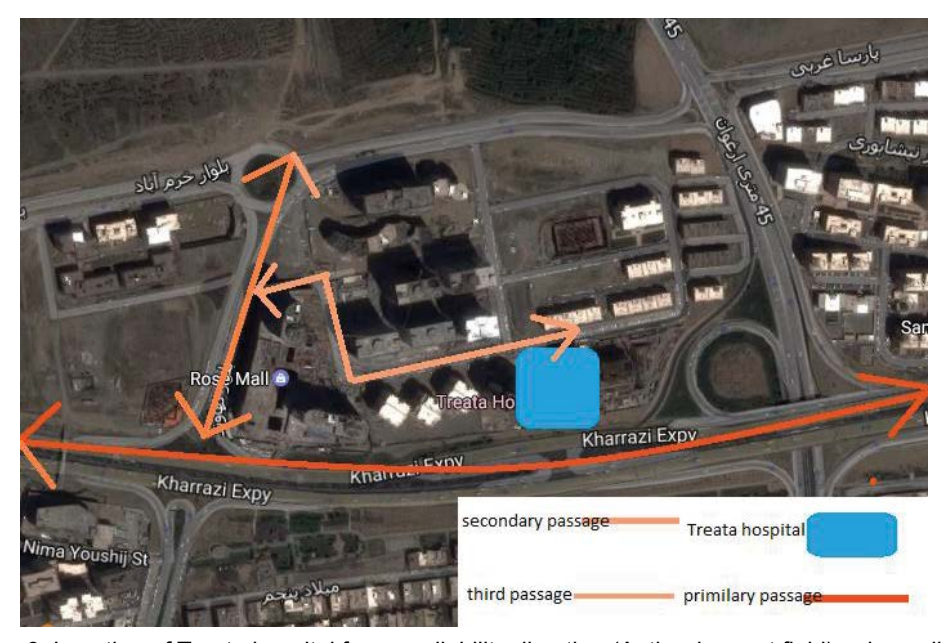
Figure 3. Location of Treata hospital form availability direction (Author harvest field) noise pollution.

According to analysing of some the main indicators of Treata hospital location, this site location has got some indicators which are not coordinate with passive