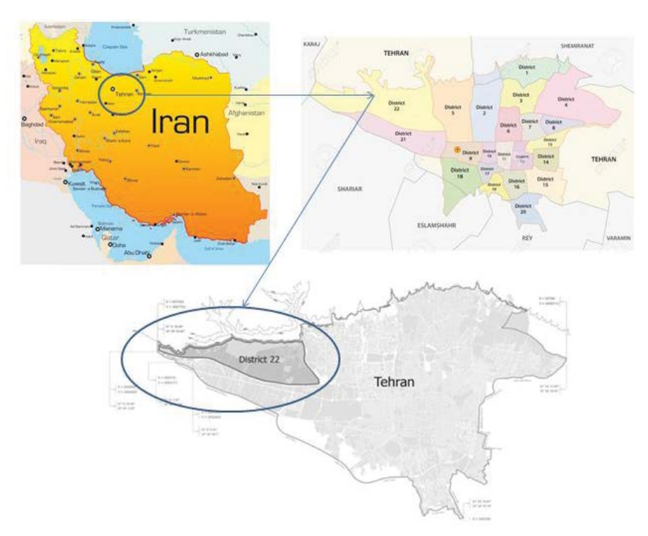
Figure 1. Location of Treata hospital in 22<sup>nd</sup> zone of Tehran [8].

From passive defense prospect, a congested and noisy area such as residential, educational area and shopping center can be harmful, due to inappropriate noises, and also in critical moments such as earthquakes, there is a possibility that other residential buildings collapse on the hospital.